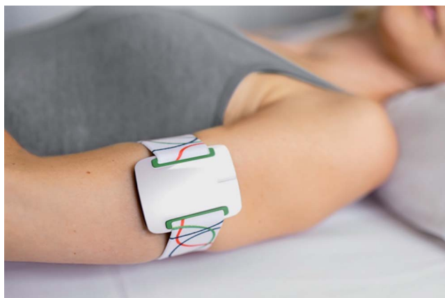
Figure 1 Multimodal sensor

The Nightwatch bracelet contains a photoplethysmographic heart rate module and a 3-dimensional accelerometer. The position on the upper arm was preferred to the wrist because of better signal quality and fewer movement artifacts. The signals or alarms are transmitted by DECT ultralow energy (DECT ULE) directly to the base, which may be connected to a local area network for further transmission of the data and alarms. DECT-ULE is a wireless communication standard with a greater range, reliability, and safety than Bluetooth or Wifi.